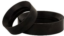
EDPM Lip Seal

EPDM – perfect for non chlorinated systems, specifically RO and NF applications. VITON – highly recommended for chlorinated environments, specifically UF applications.