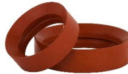
Viton Lip Seal