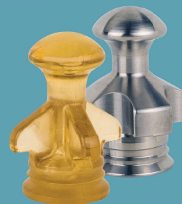
Blank End Plugs (BEP)