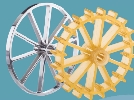
Anti-Telescoping Devices (ATD)